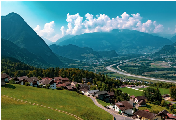
The Rhine from Triesenberg