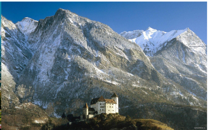
Vaduz Castle at the foot of the cliff