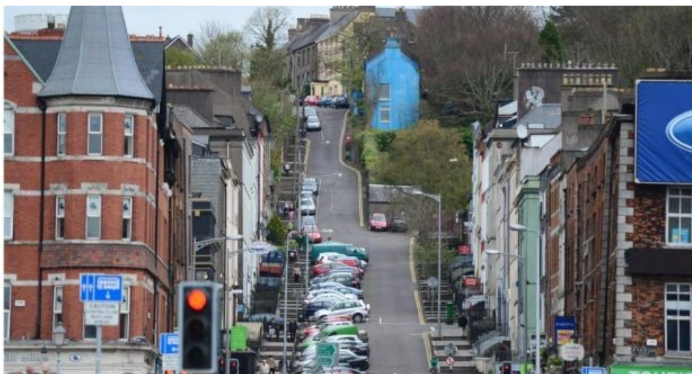
St Patrick's Hill

From 1985 to 1992, a Tour of Ireland was organized, under the name « Nissan Classic ». Seskin and St Patrick's Hills were very often among the « Kings of the Mountain ». Also a very amazing Cairmont Cairn, in which Roche, Breukink and Armstrong battled for the victory in 1992.