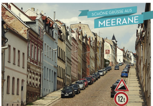
Le fameux mur médiatique de Meerane