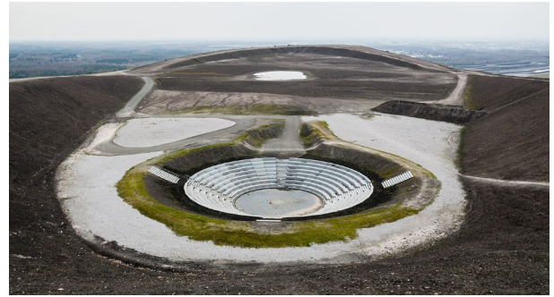
L'amphithéâtre sommital de Halde Haniel

And some unusual places, like an amphitheater set up at the top of a slag heap, or a Soviet airliner, nicknamed "Lady Agnes", landed in the middle of nowhere.