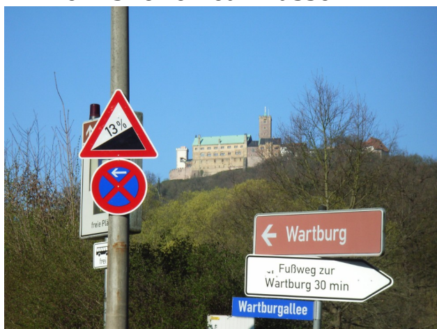
Forteresse de Wartburg

The national Challenge gives pride of place to places of interest. Among them, several are registered in the UNESCO World Heritage: the Upper Middle Rhine Valley (including Loreley), the rococo church of Wies, the city of Bamberg, the fortress of Wartburg, the Park Wilhelmshöhe near Kassel.