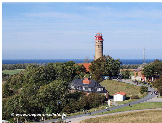
Kap Arkona : l'Allemagne en bord de mer

The national Challenge gives pride of place to places of interest. Among them, several are registered in the UNESCO World Heritage: the Upper Middle Rhine Valley (including Loreley), the rococo church of Wies, the city of Bamberg, the fortress of Wartburg, the Park Wilhelmshöhe near Kassel.