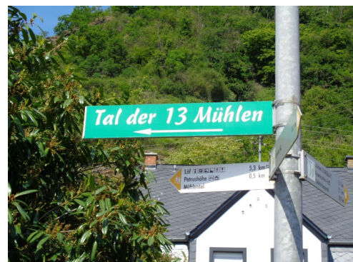
Tal der 13 Mühlen