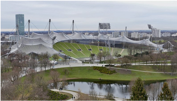
Olympiaberg : le mont du site olympique