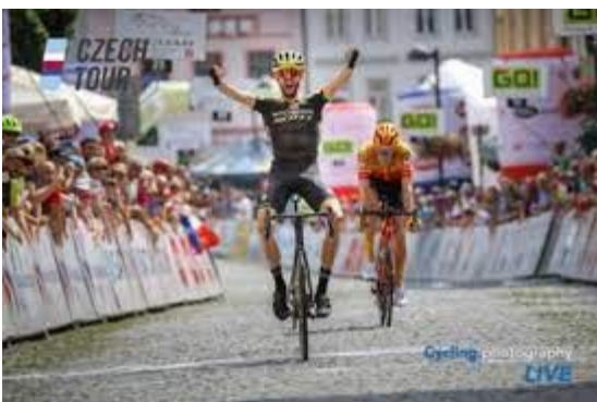
Tour de Tchèque

* professional races with the Bohemian Tour, the Czech Cycling Tour or the Peace Race for men and the Tourdufeminin for women