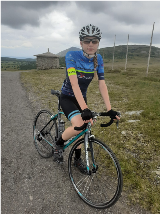
Modré sedlo (1510m)

* altitudes over 1000m reached in the national mountains,