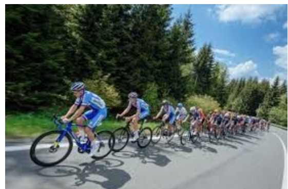
Course de la Paix