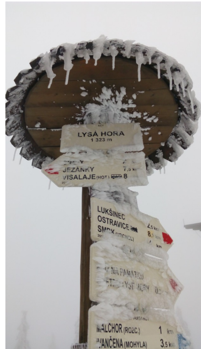
Lysa Hora (1323m)

* not forgetting the cyclo-cross classic races, beautiful sites with Bohemian paradises or Jeseniky landscapes for example,